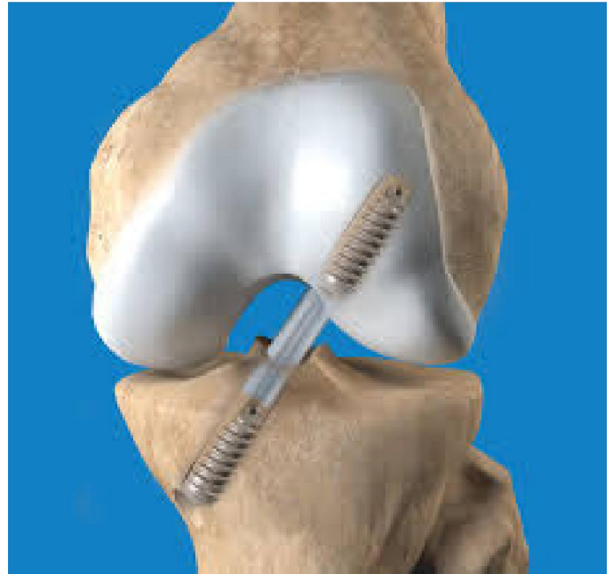
Patella tendon ACL graft

The success of the operation is very dependent on you. A lot of hard work is required to get the knee as strong as possible before the operation and to rebuild the muscles and restore the knee motion after the operation. Your knee may not be normal following the surgery but if all goes well and you work hard it should be greatly improved from the painful unstable knee you currently have.