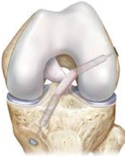
Hamstring ACL graft