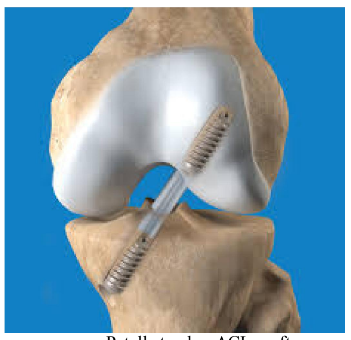
Patella tendon ACL graft

The success of the operation is very dependent on you. A lot of hard work is required to get the knee as strong as possible before the operation and to rebuild the muscles and restore the knee motion after the operation. Your knee may not be normal following the surgery but if all goes well and you work hard it should be greatly improved from the painful unstable knee you currently have.